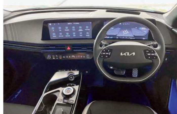
The EV6's interior is modern and minimalist, and it has hints that point to the absence of an ICE powertrain

The last EV I tested at the Buddh Circuit was the Porsche Taycan. While I'm not going to attempt compar-